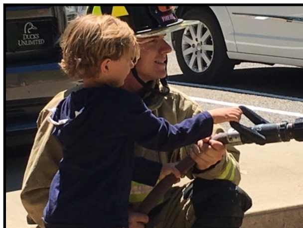
Local firefighters were a big hit when they stopped by the Library.