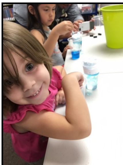
Children had fun learning about clouds.