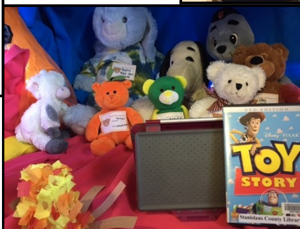
Furry friends spent the night exploring everything the library has to offer.