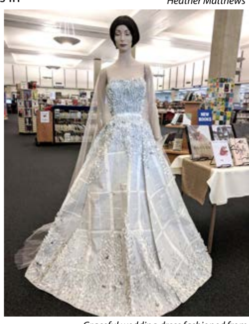
Graceful wedding dress fashioned from recycled encyclopedias.