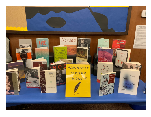
The library celebrated National Poetry Month with a table of poetry books!

We are getting monthly updates on the progress of the library project. Attend one of our meetings to hear what is happening. Our meetings are held on the first Wednesday of each month at 6:30 PM at the library.