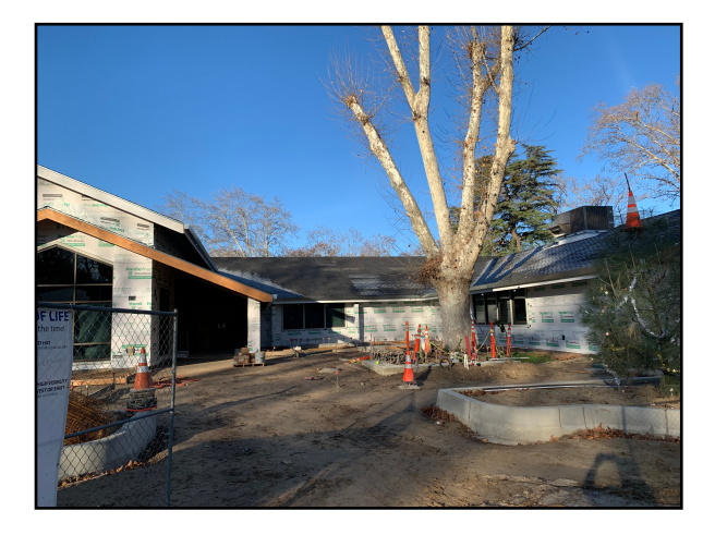
The new entrance to the Turlock Library.