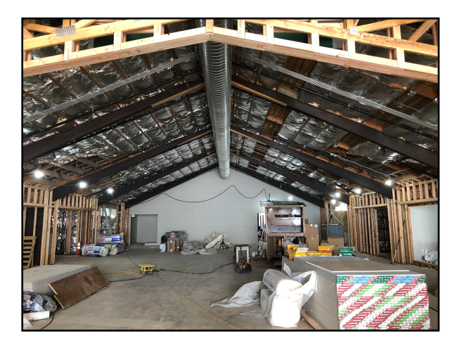
The Adult Collection.