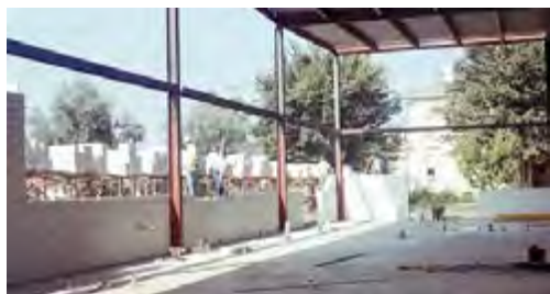
The walls go up! Construction of the 62,000 sq. ft. Modesto Library began in 1970 and was completed in November 1971.

Throughout the year we'll highlight stories about the building and events such as the April 29, 1970 groundbreaking; why a new library building was important to the community and comments on the building then and now. If the library is able to offer full services sometime this year, FOML might even be able to do some on-site celebrating.